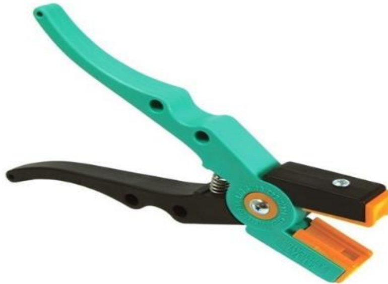
V6 Sheep SET Tag Applicator

APHIS only provides applicators to regulatory personnel for their use.